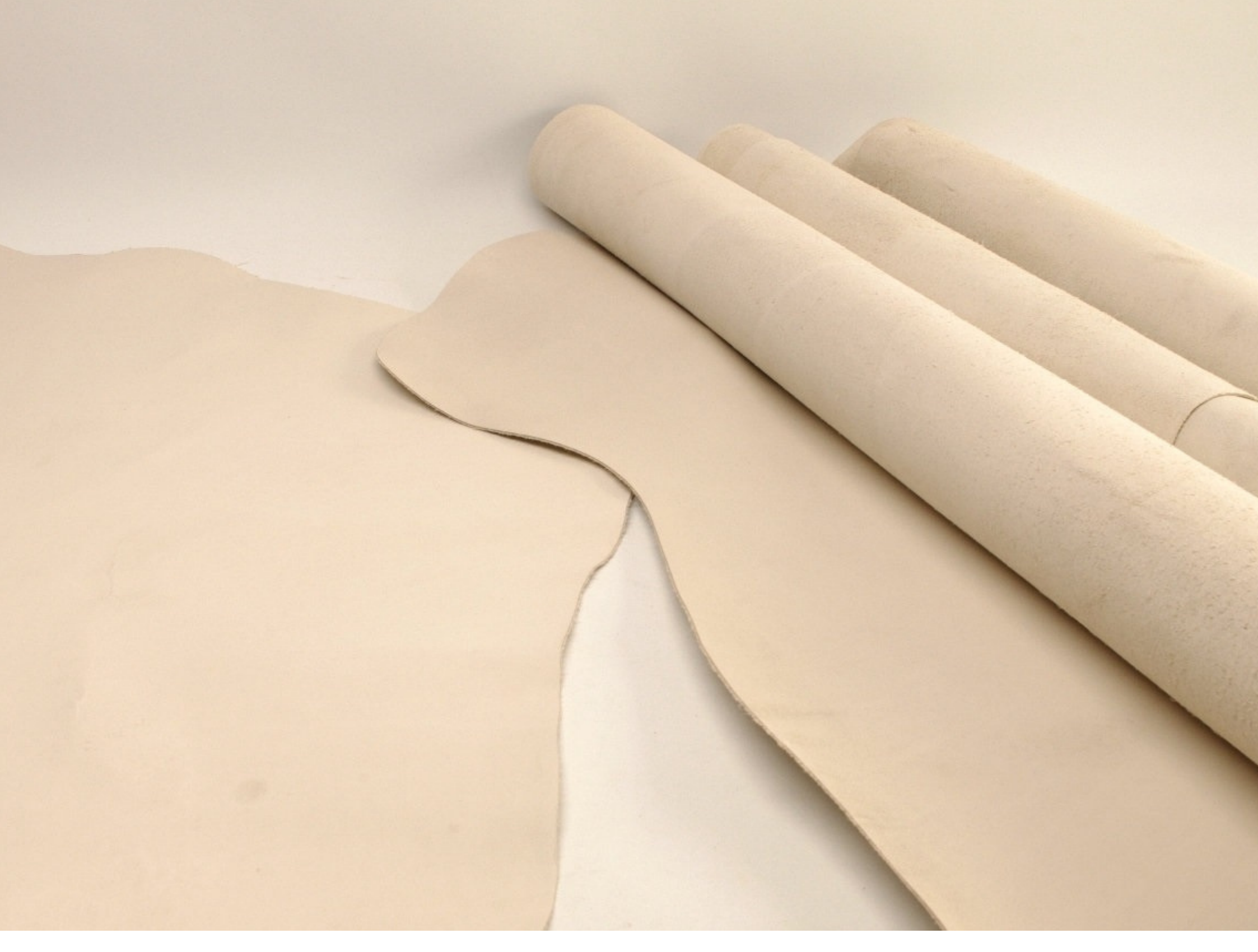
Cow Drum-dyed Crust Leather