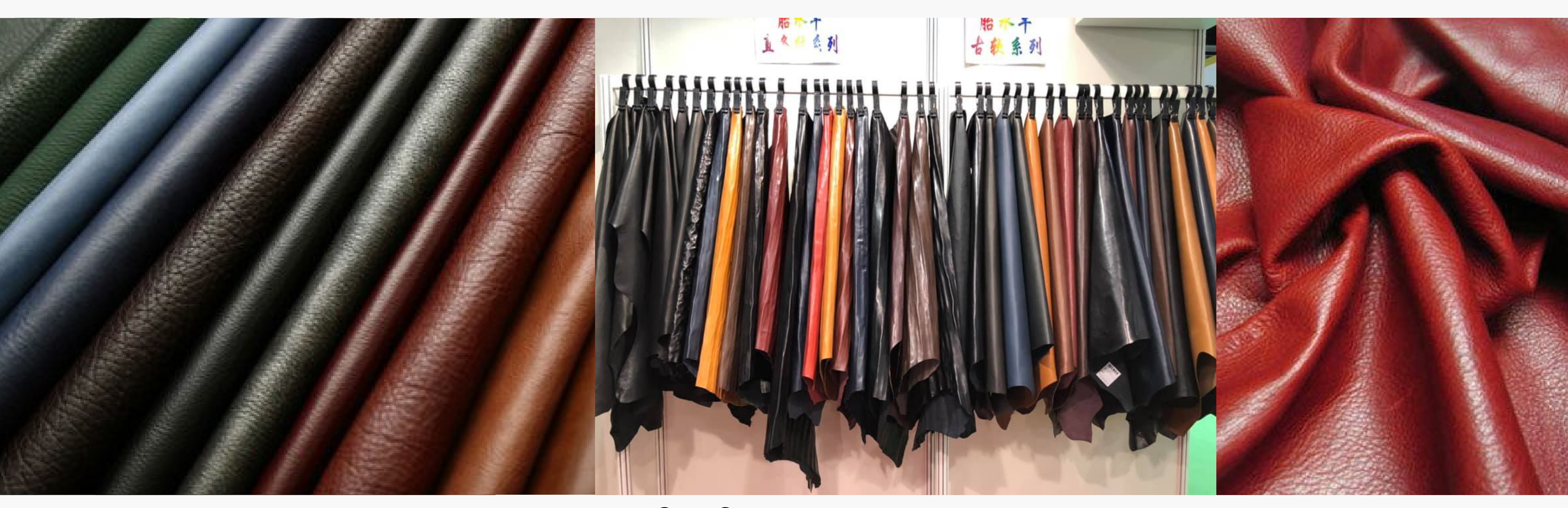
Cow Finished Leather